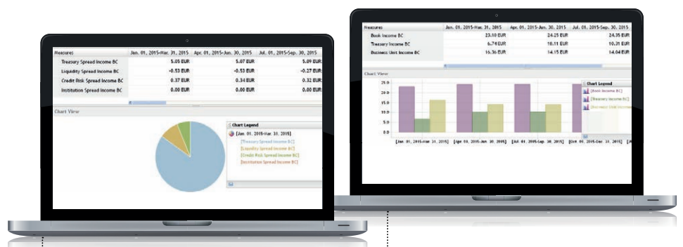
Spread income components breakdown over time

FTP output can be integrated into OneSumX for Finance, which enables additional functionality for: Customer and product profitability analysis, cost allocation, P&L Explain and risk-adjusted performance solutions.