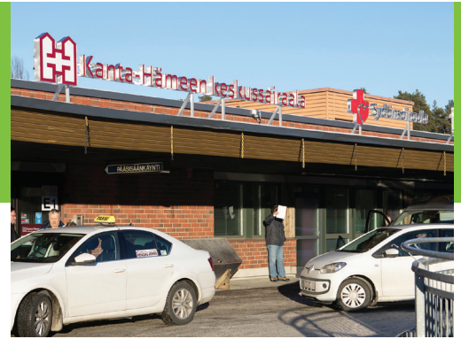
Kanta-Häme Central Hospital (KHCH)