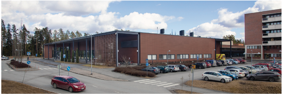
Kanta-Häme Central Hospital (KHCH)