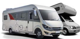
Recreational vehicles (RVs) and trailers

By simplifying title processing and perfection, Lien Solutions gives you flexibility and confidence, so that wherever your lending business goes, you know we'll be there for you. We offer titling and registration support for specialty asset types, including: