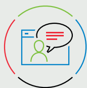
Vitamin D Deficiency on 5minutesConsult.com

At no additional charge, physicians and nurses can accrue and track their CME/ CE credits. As they search the site and treat their patients, clinicians can accrue up to .5 credits for each topic questionnaire they submit. This activity has been reviewed and is accepted for up to 20 prescribed credit(s) by the American Academy of Family Physicians and the American Nurses Credentialing Center's Commission.