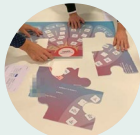
Board of Puzzle Pieces