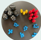
Solid Dice and Tokens