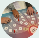
Voting Reveals Alignment