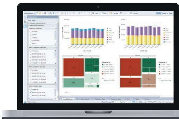
OneSumX Business Analytics Trend Analysis

From contract level data management, through to risk, liquidity, income calculation and cost allocation and final regulatory reporting, OneSumX provides unique end-to-end consistency of data, assumptions and analysis. With this as a foundation, OneSumX Business Analytics provides a tool to use that goldmine of data and results to its fullest extent, thereby supporting a wide range business needs and regulatory expectations.