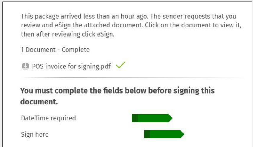
Hassle-free click and sign