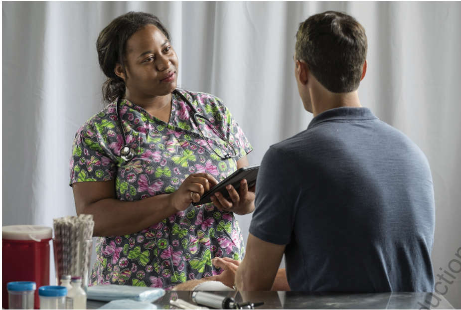
FIGURE 1-4 Nurse taking a health history.

Focusing on the answers (verbal) and the actions (nonverbal) of the patient, the nurse is constantly assessing and formulating a plan of care so that the patient can achieve the best possible health (Fig. 1-4).