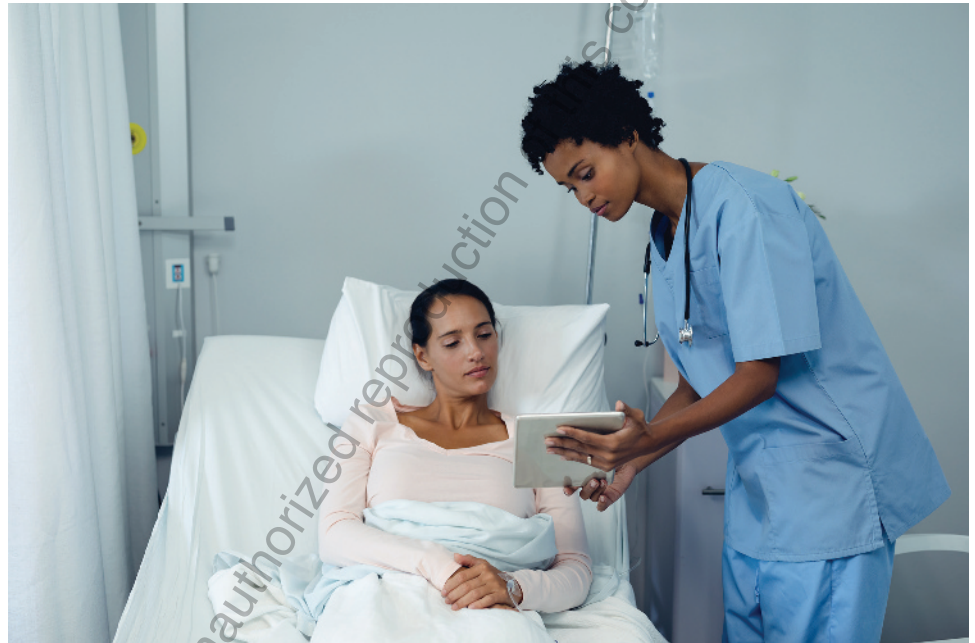
FIGURE 1-1 Collaboration to determine the best assessment strategies.

In all aspects, it is best to work with the patient to enable partnering in choices. This allows the patient to make decisions regarding health care. The more a patient participates in these decisions, the better the outcomes are for a long-term healthier lifestyle. Reminding ourselves of the social determinants of health and how they may affect each person individually is important in determining the plan of care.